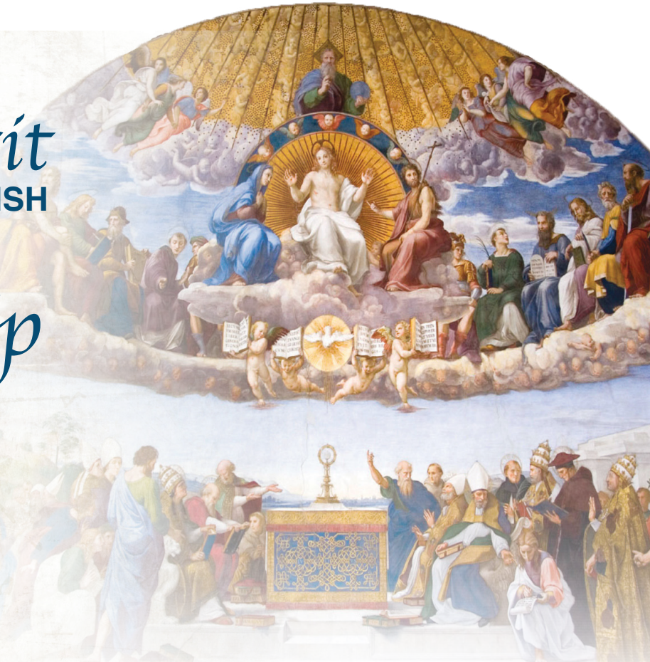
Disputation of the Holy Sacrament. Raphael (1509-10)

LORD, THIS IS THE PEOPLE THAT LONGS TO SEE YOUR FACE. ~ PSALM 24